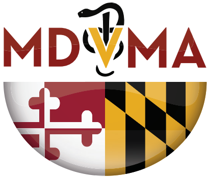
EXHIBIT & SPONSORSHIP OPPORTUNITIES